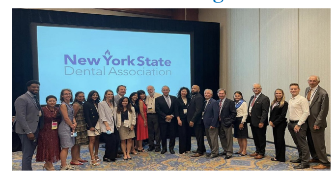
Representatives of the Society's leadership, along with two Columbia University dental students, at the NYSDA House of Delegates in August.

The annual NYSDA House of Delegates Meeting, postponed this year due to COVID concerns, was held on 8/13-15 in Jersey City. The event brings organized dentistry leaders throughout New York State together to consider a variety of resolutions to improve the practice of dentistry. The meeting strives to represent the diverse dental community of New York.