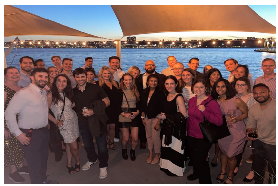
Attendees of the June 24 New Dentist event take a moment for a group photo.

Our New Dentists Committee held a highly-successful (and much sought-after) in-person social event just as COVID restrictions started to lift at the end of June. The "welcome back" event on June 24 was held outdoors on a lovely terrace overlooking the Hudson on a perfect early summer night.