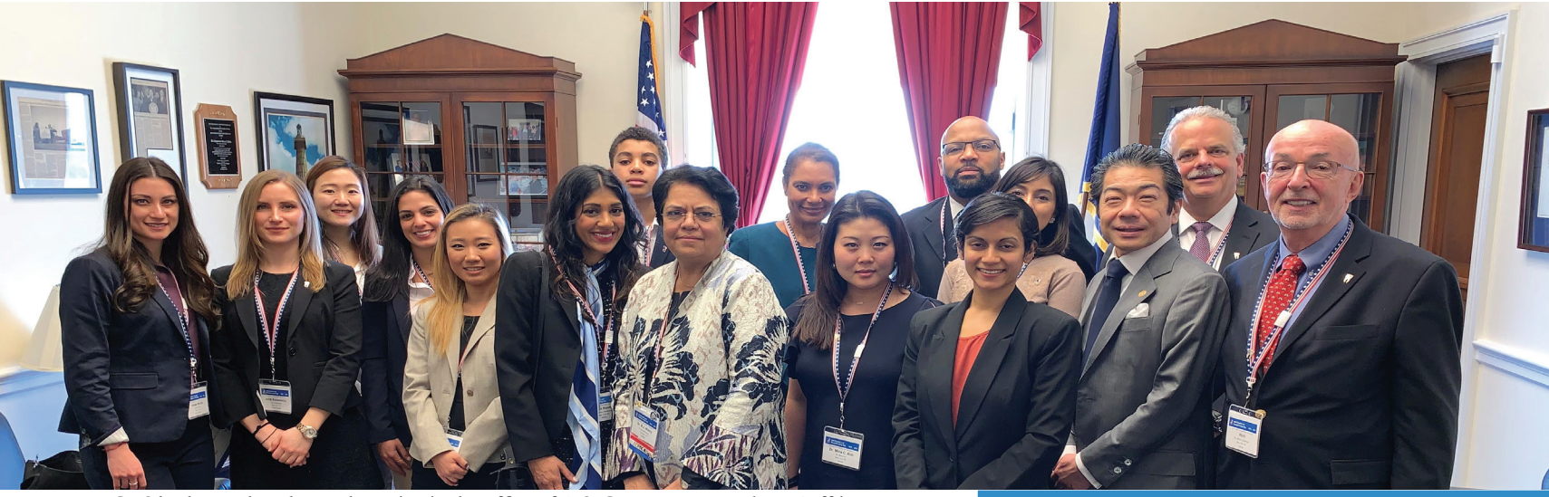
NYCDS leaders and students advocating in the office of U.S. Congressman, Hakeem Jeffries.